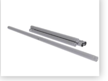
1. Extend and lock the support poles.