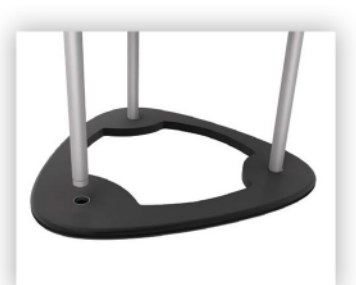
2. Place the 3 poles with the holes facing up.