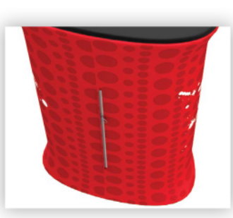
9. The zipper on the back is used to access in side the unit.