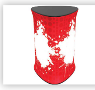
8. Turn counter back over.