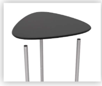
3. Place counter top onto poles. Tap down with hand to secure.