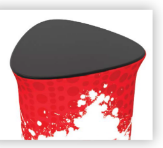
5. Angle and tuck gasket into channel in edge of counter top. Insert graphic gasket all the way around.