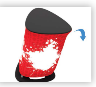
6. Turn counter upside-down.